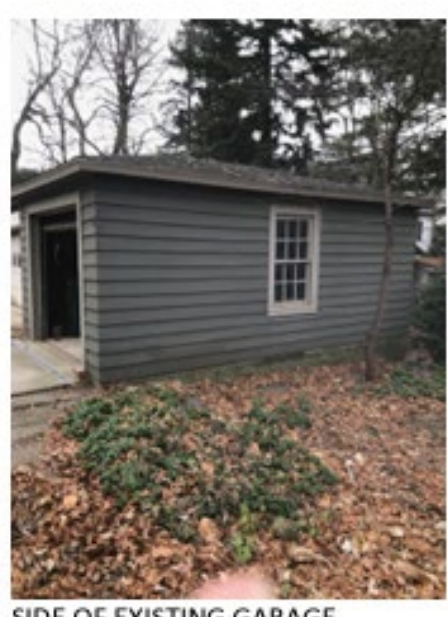
SIDE OF EXISTING GARAGE