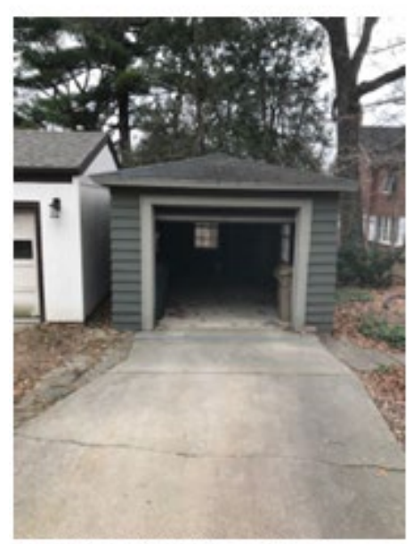
FRONT OF EXISTING GARAGE