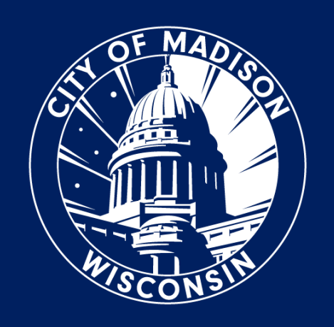
2450 Atwood Avenue Certificate of Appropriateness April 15, 2024