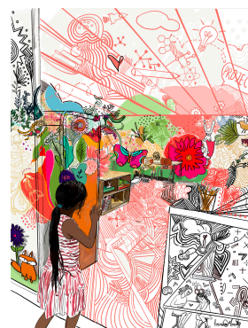
Endless Possibilities 2023 Digital Drawing

Artwork by Poornima Moorthy happymiraclearts@gmail.com