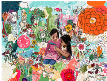
Exploring Whimsyland 2023 Digital Drawing