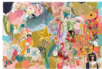
Fantastic Adventures in Whimsyland 2021 Digital Drawing