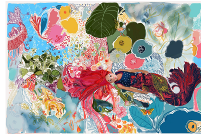
My Little Mermaid 2021 Digital Drawing