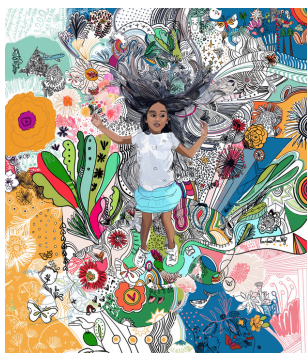
Girl Power 2023 Digital Drawing