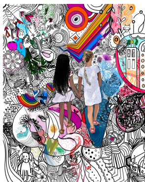
Friendship 2023 Digital Drawing