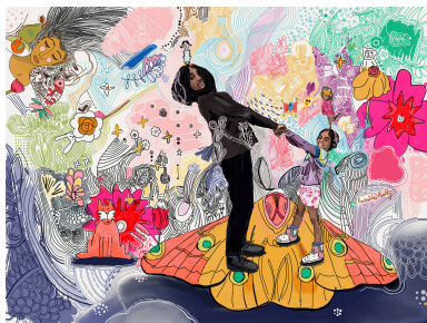
Sibling Love 2020 Digital Drawing