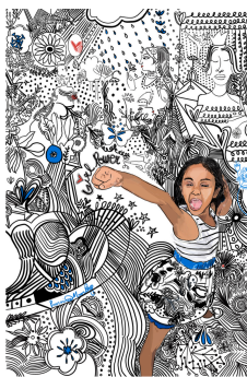
Girl Power II 2023 Digital Drawing