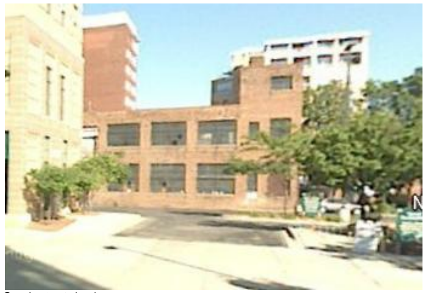
Google street view images