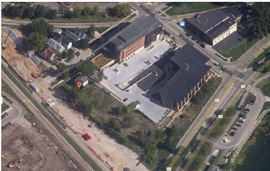
Google map images