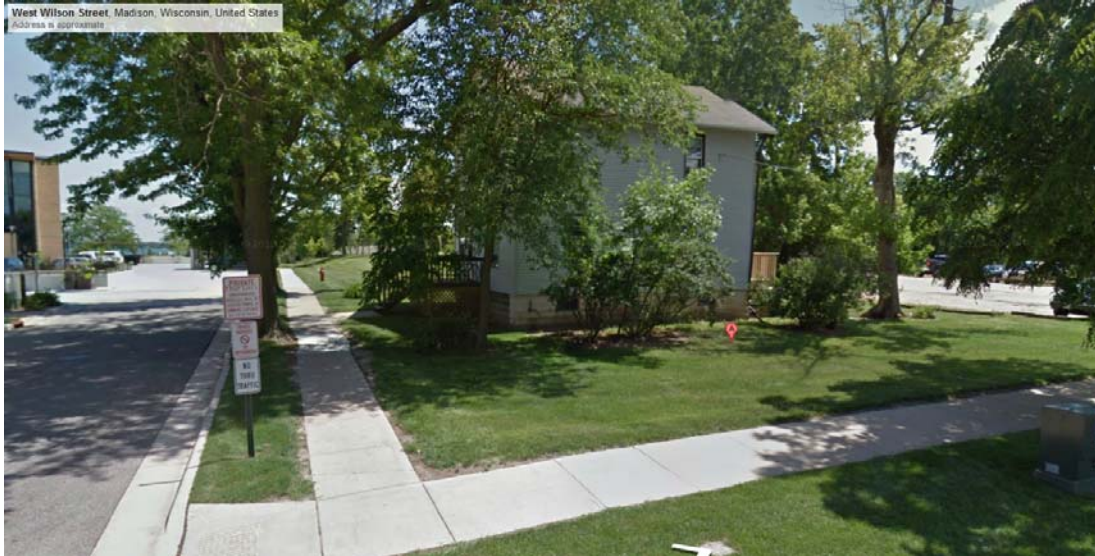
Google street view image