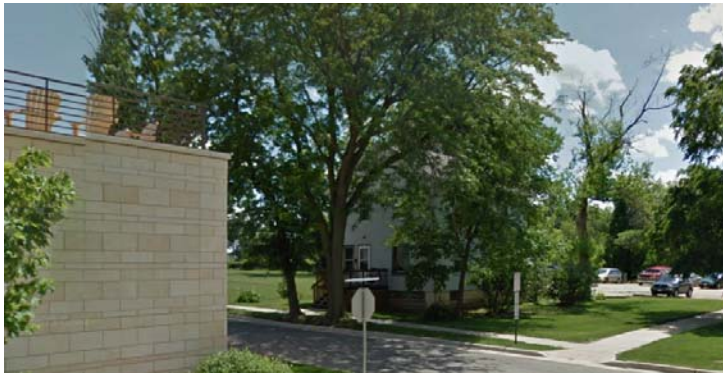
Google street view image