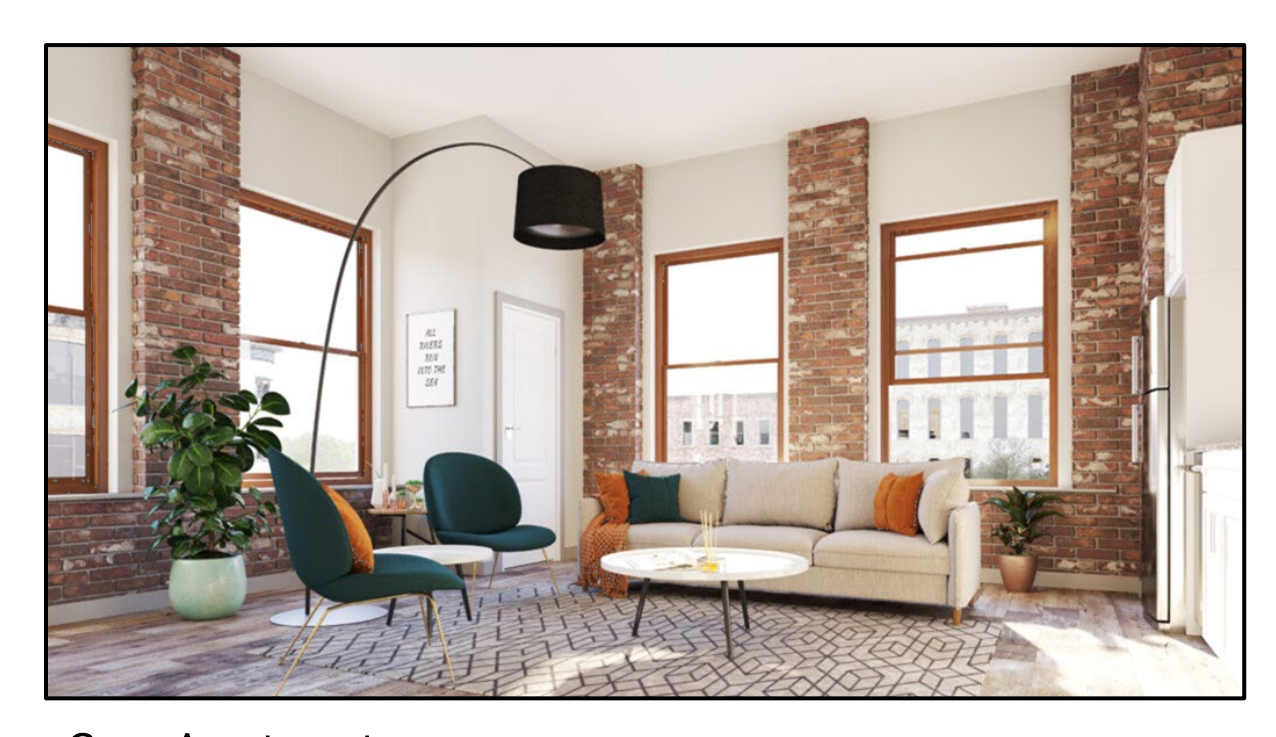
Cove Apartments Duluth, MN Roers Companies