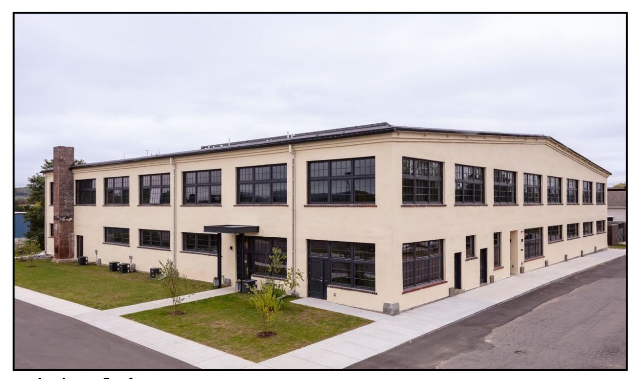
Atrium Lofts Wausau, WI MetroPlains