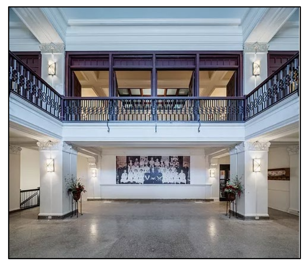
Hotel Maytag Newton, IA Hatch Development Group

Get the capital you need, when you need it