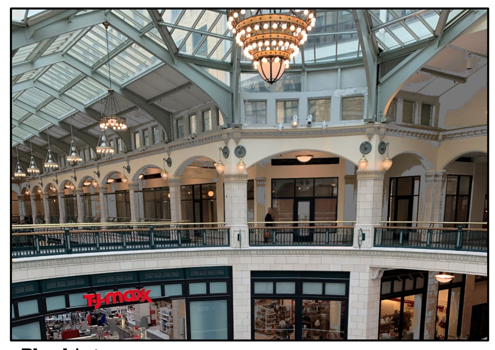
Plankinton Arcade Milwaukee, WI Hempel