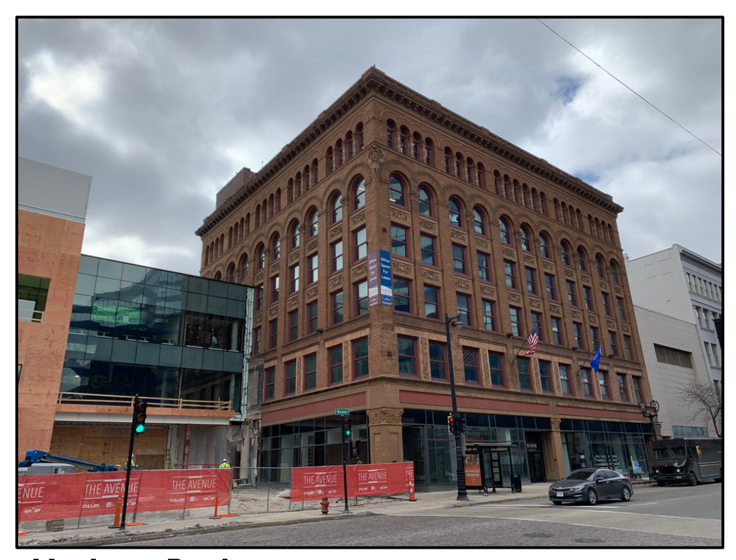
Matthews Brothers Building Milwaukee, WI